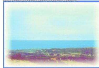
Seascape views from Villa Alexandra

The whole villa is furnished throughout with luxury furniture in the Cretan colours of deep blue, white and aqua