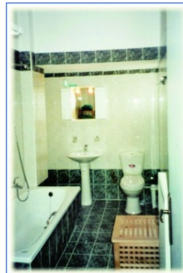
The fully tiled bathroom with separate shower and bath

Long, sandy beaches Breathtaking scenery Peaceful and relaxing