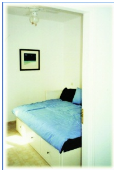
The master bedroom on one of the floors