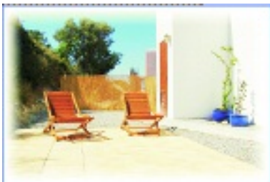
The upper 'suntrap' patio

Azure blue skies Glorious climate Crystal-clear seas